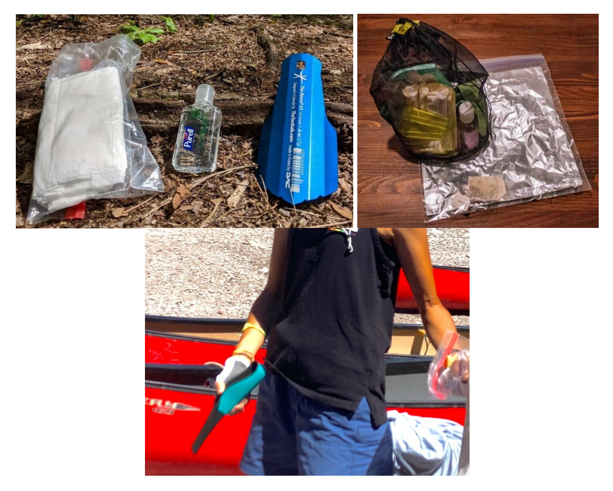
Examples of bathroom materials (top left), a period "go kit" (top right), and a pee funnel (bottom).

Privacy, or lack thereof: The landscape will influence the amount of privacy that you have. Working in a grassland or a desert might offer less privacy than a forest. No matter your bathroom situation, it is advisable to follow these rules.